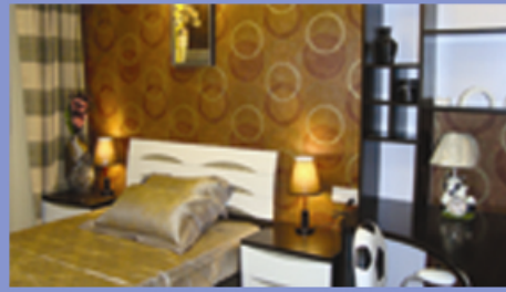
KID'S BED ROOM