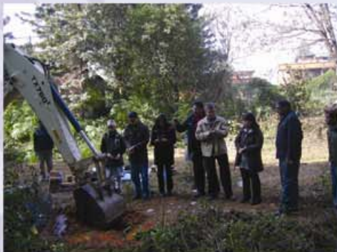
FOUNDATION STONE LAYING OF WESTAR SKYLIVING AT SOALTEE MODE