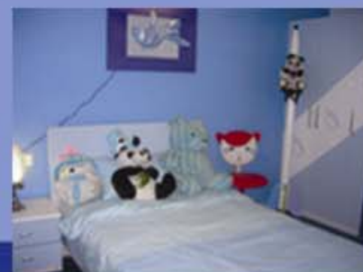
KID'S BED ROOM