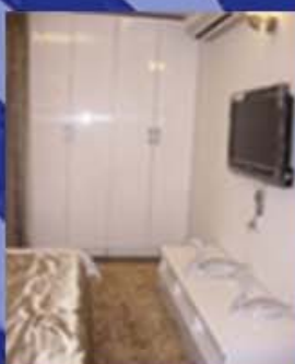
MASTER BED ROOM WARDROBE