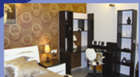
KID'S BED ROOM STUDY TABLE