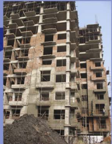
TOWER 1 ELEVENTH FLOOR SLAB CASTING (WESTAR RESIDENCY, BALKUMARI)