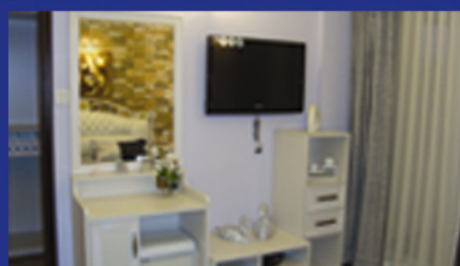
MASTER BED ROOM WARDROBE