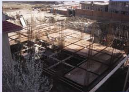
TOWER 2 BASEMENT 2 SLAB CASTING (WESTAR RESIDENCY, BALKUMARI)